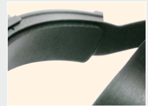
Comfortable cell foam on back of headgear.