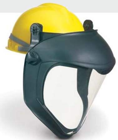
Hard Hat Adapter Accessory

*Face shield offers secondary protection and MUST be worn with spectacles or goggles.