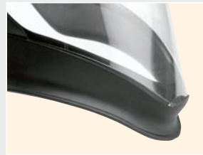
Shell offers built-in chin protection and extended top-of-head coverage.